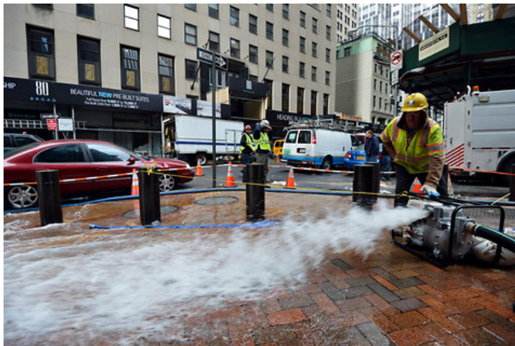
Restoration after Hurricane Sandy